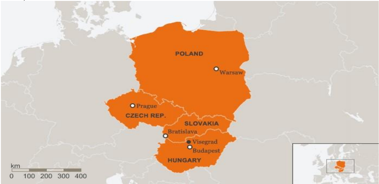
Figure 1. Map of the study area

The latest innovation performance report on the Visegrad countries paints a mixed picture of innovation in these countries (Hudec, 2015). As shown in Table 2 below, these four countries are categorized as moderate innovators with weak innovation capabilities and trailing EU average on all innovation benchmarks (Odei et al., 2021). Current science technology and innovation (STI) policy follow the traditional centralized top-down nature. Current sectoral innovation policies often ensue in embryonic national and regional innovation systems and weak innovation performances. Given that innovation, new knowledge and technologies are crucial means to achieving rapid and sustainable growth, these economies innovations in these countries making them lag other EU countries include low public support for innovations and R&D, ineffective firms' partnership, weak patent applications, shortage of skilled human capital, along with low adoption of new technologies (Skala & Beauchamp, 2017; Gyimesi, 2021).