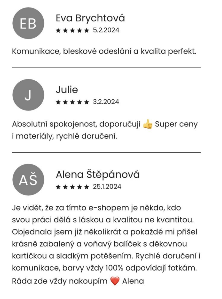
Figure 5 Customers' satisfaction with La Mode's quick shipping