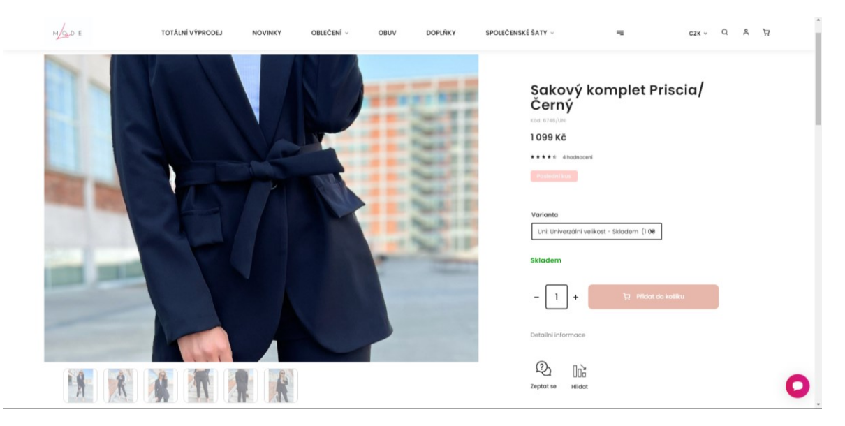
Figure 4 Zooming in on the product

La Mode's website is simple, aesthetically pleasing, and easy to navigate. The navigation menu is detailed, and high-quality pictures show the products' details. La Mode also involves a feature that zooms in on the product when customers mouse over the photo (as shown in Figure 4). The competitor's websites do not include this feature.