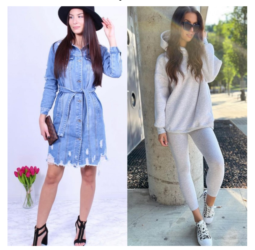
Figure 2 Photography skills comparison - 2020 vs. 2023

suppliers and by dealing with customer service almost every day. La Mode emphasizes its customer service and caters to customers if possible.