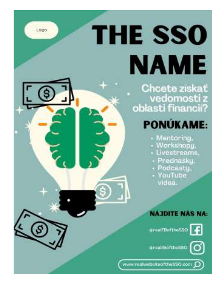
Figure 3. Design of the flyer (Own processing)