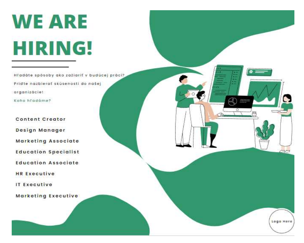
Figure 4. Design for Instagram post (Own processing)

designated for Instagram, whereas Figure 5 showcases an Instagram Story idea adjusted to the winter season.