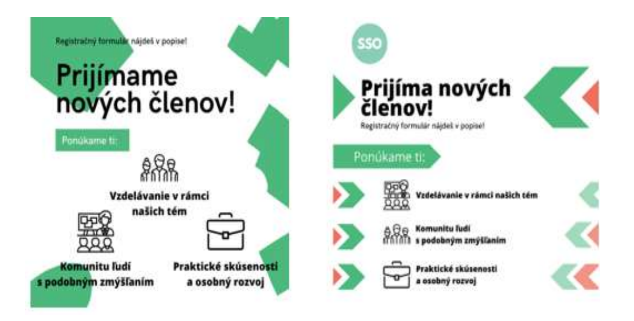
Figure 2. Posts aimed on finding candidates posted by SSO (Own processing)