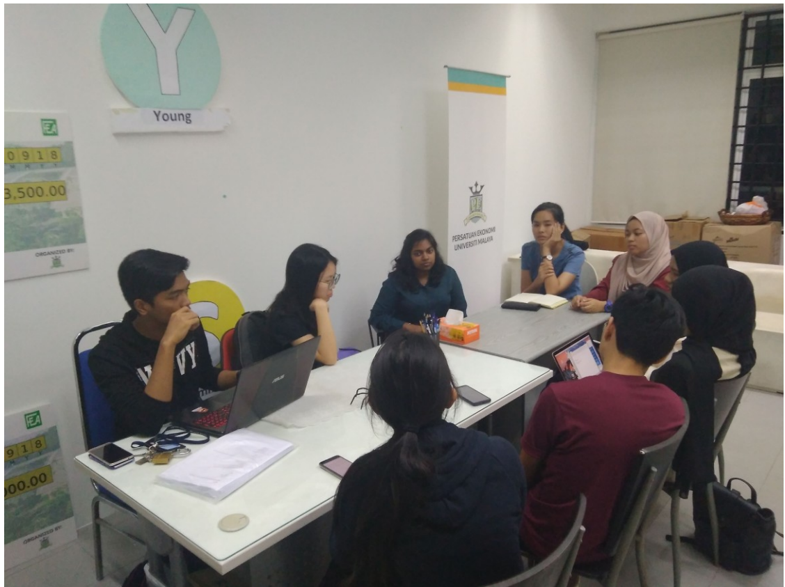
APPENDIX 1_I: The PEKUMA Meeting