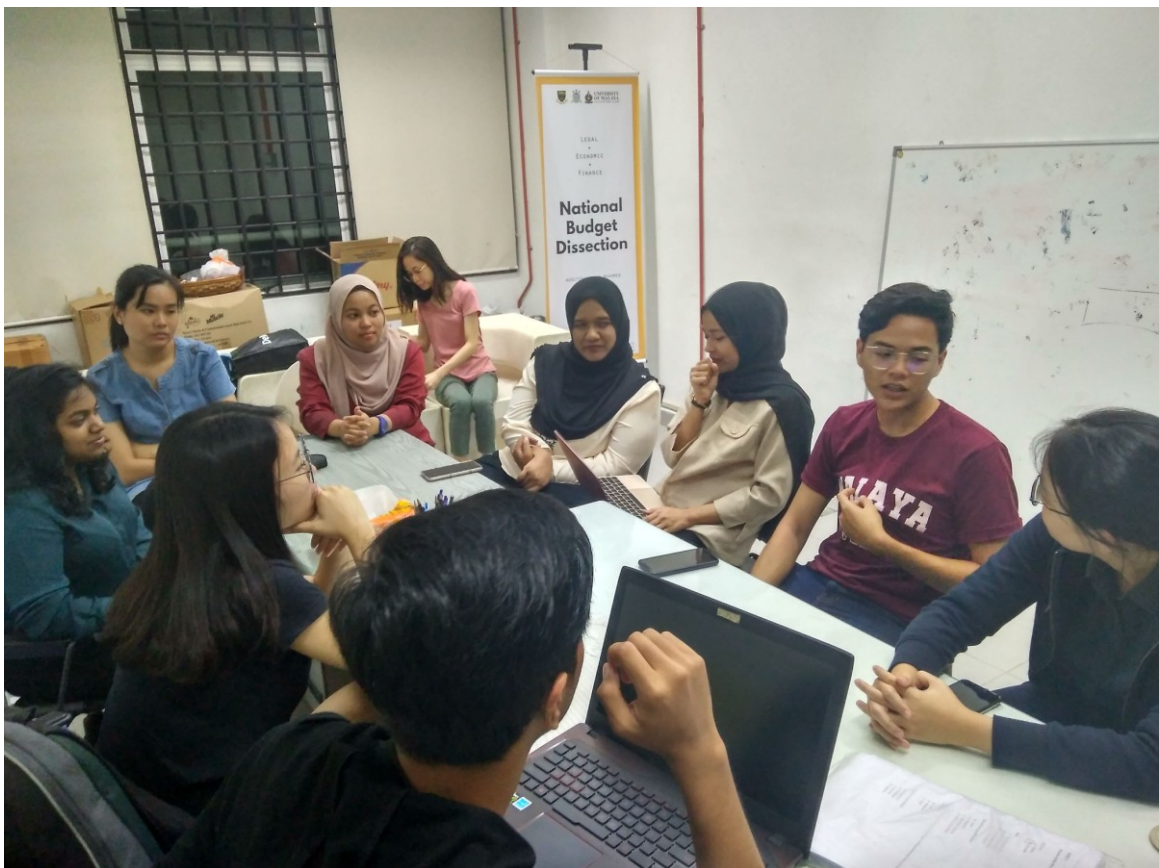
APPENDIX 1_X: The PEKUMA Meeting