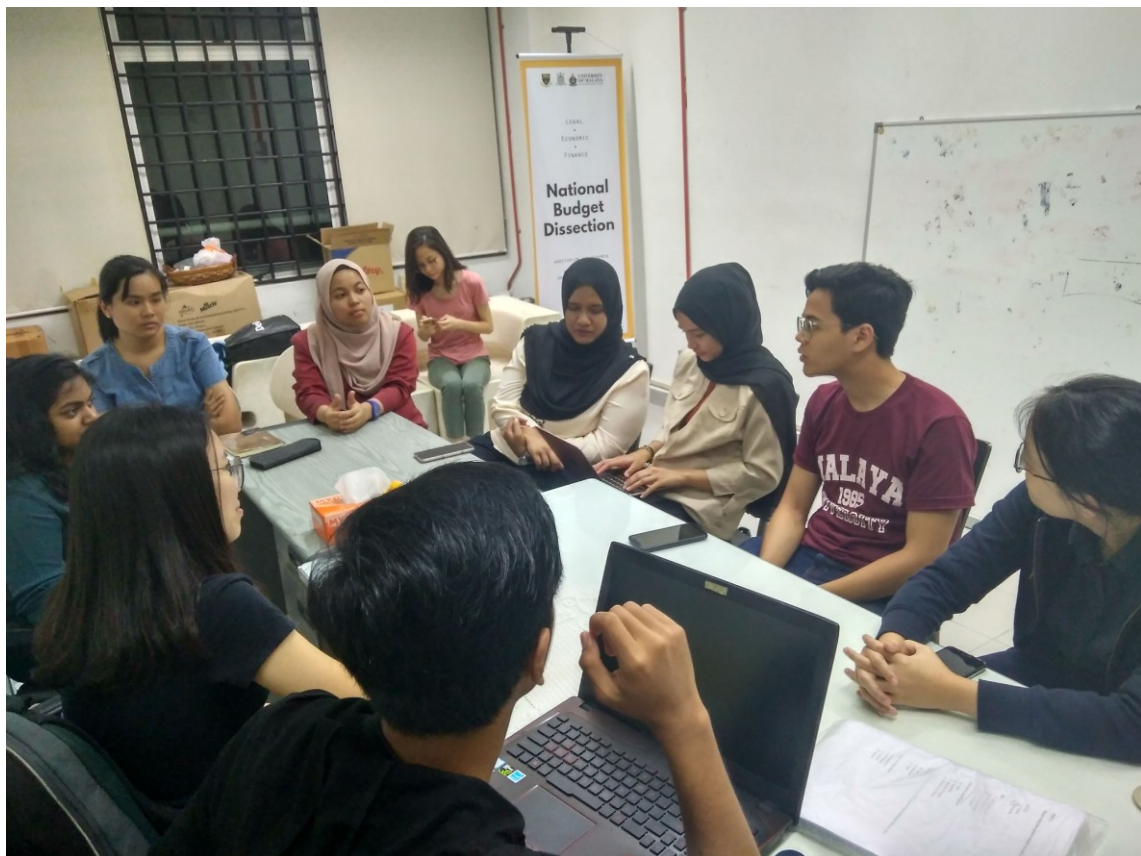
APPENDIX 1_XII: The PEKUMA Meeting