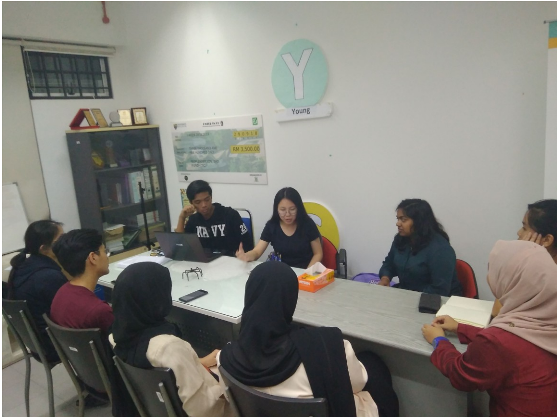
APPENDIX 1_III: The PEKUMA Meeting