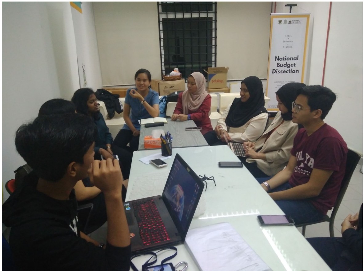
APPENDIX 1_VII: The PEKUMA Meeting