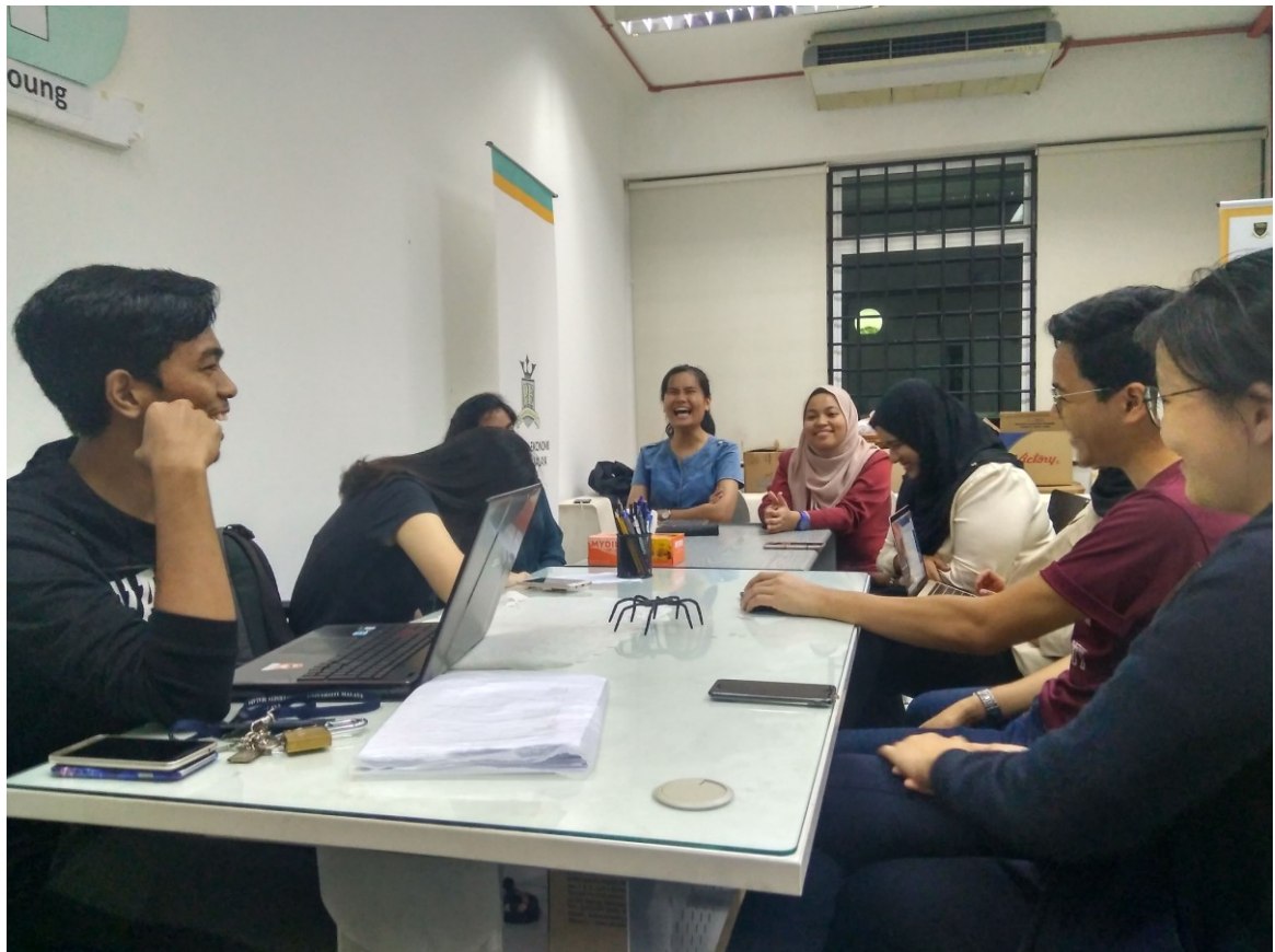
APPENDIX 1_XIII: The PEKUMA Meeting