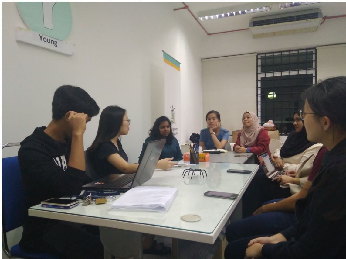
APPENDIX 1_V: The PEKUMA Meeting