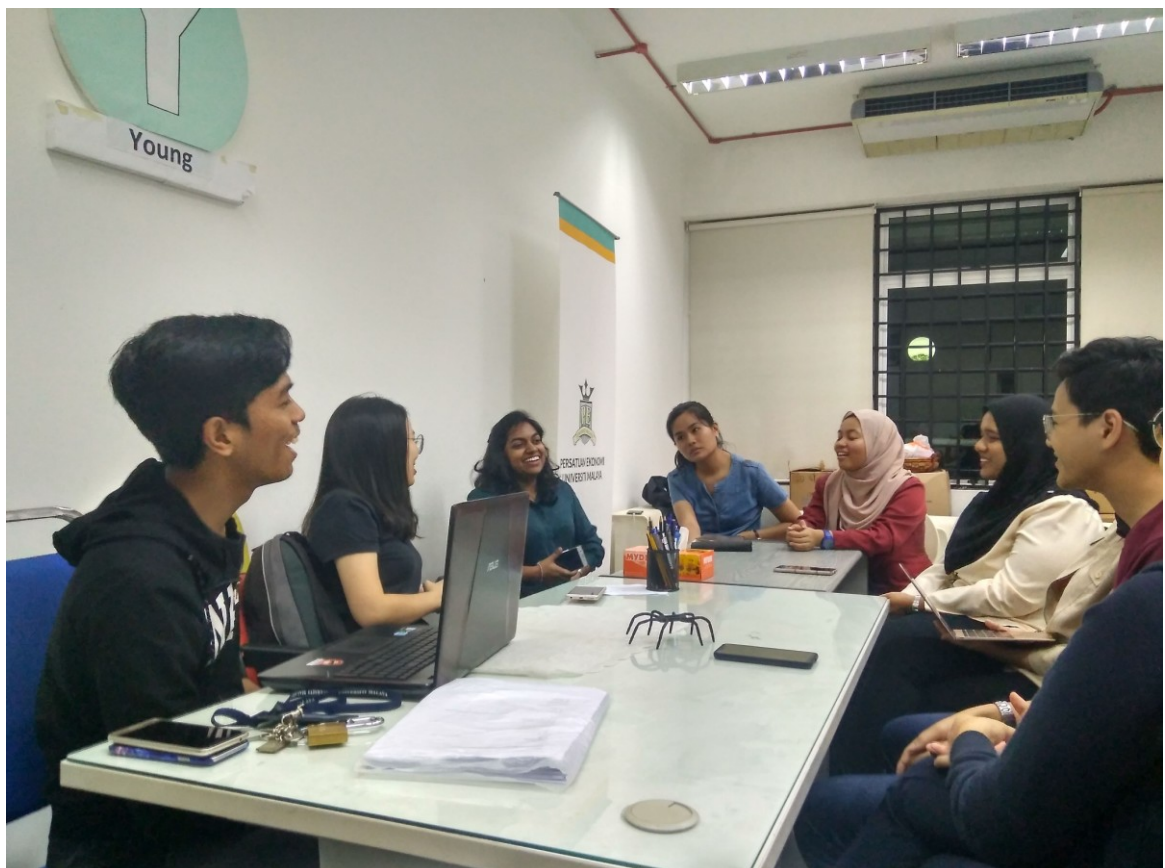
APPENDIX 1_XIV: The PEKUMA Meeting