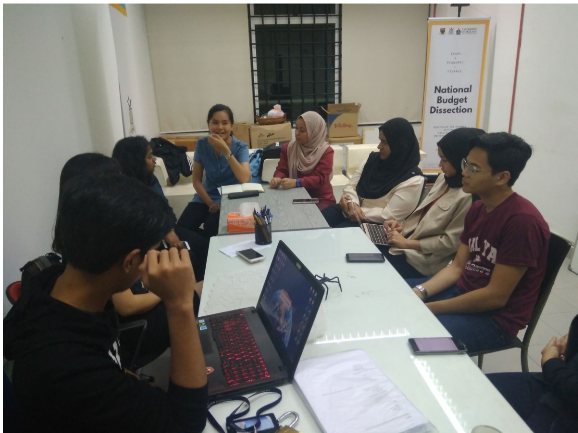
APPENDIX 1_VI: The PEKUMA Meeting