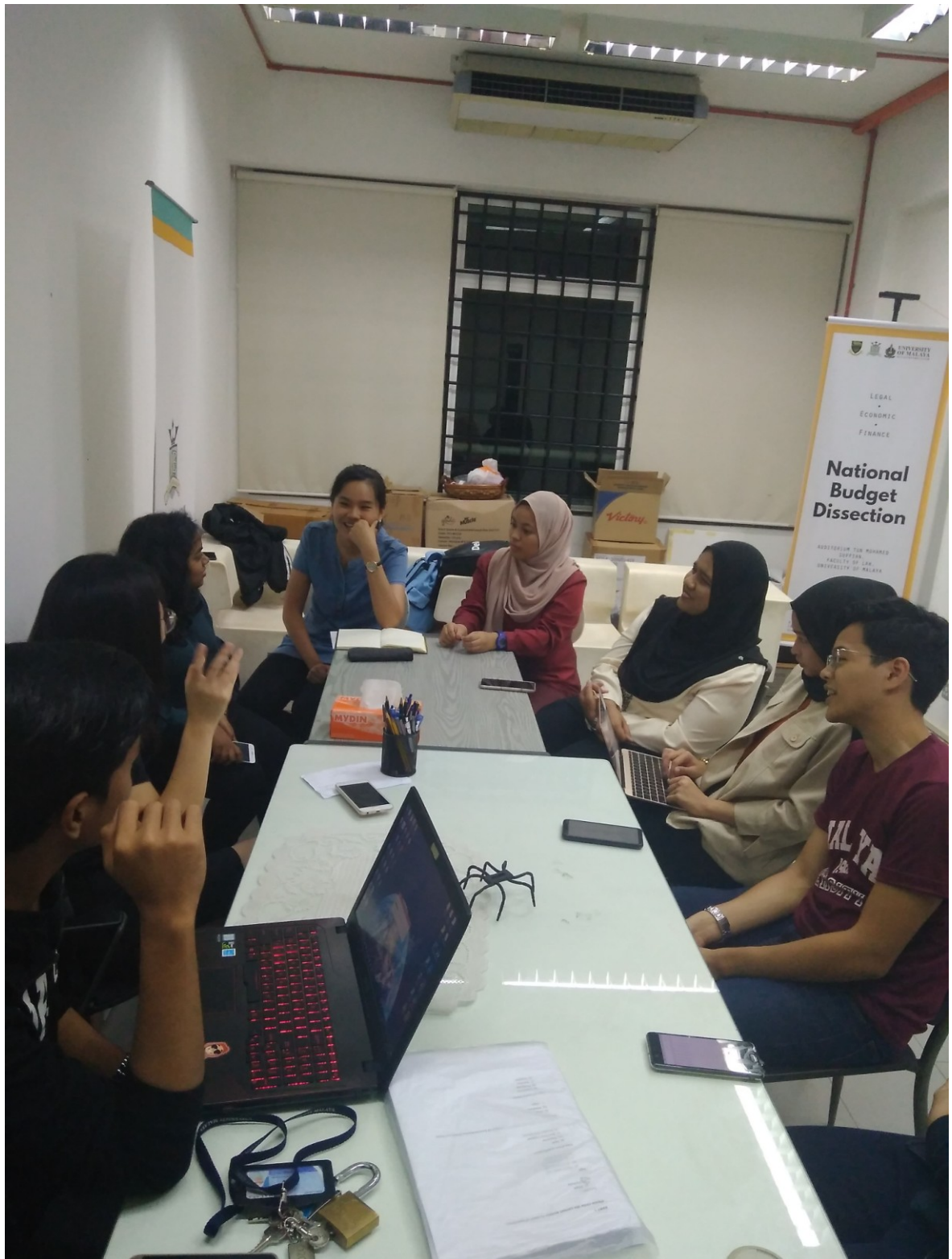
APPENDIX 1_VIII: The PEKUMA Meeting