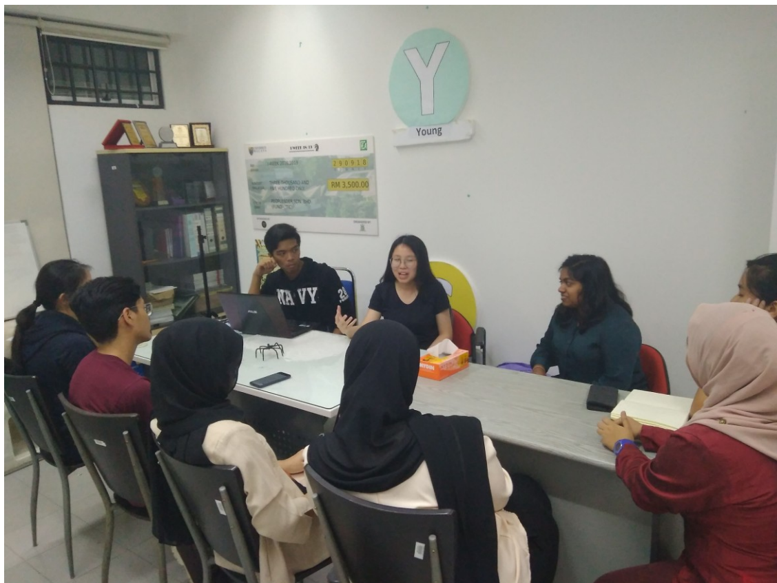
APPENDIX 1_II: The PEKUMA Meeting