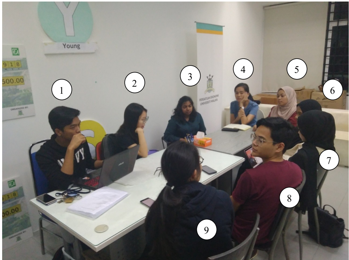
Figure 1: The Group Observed