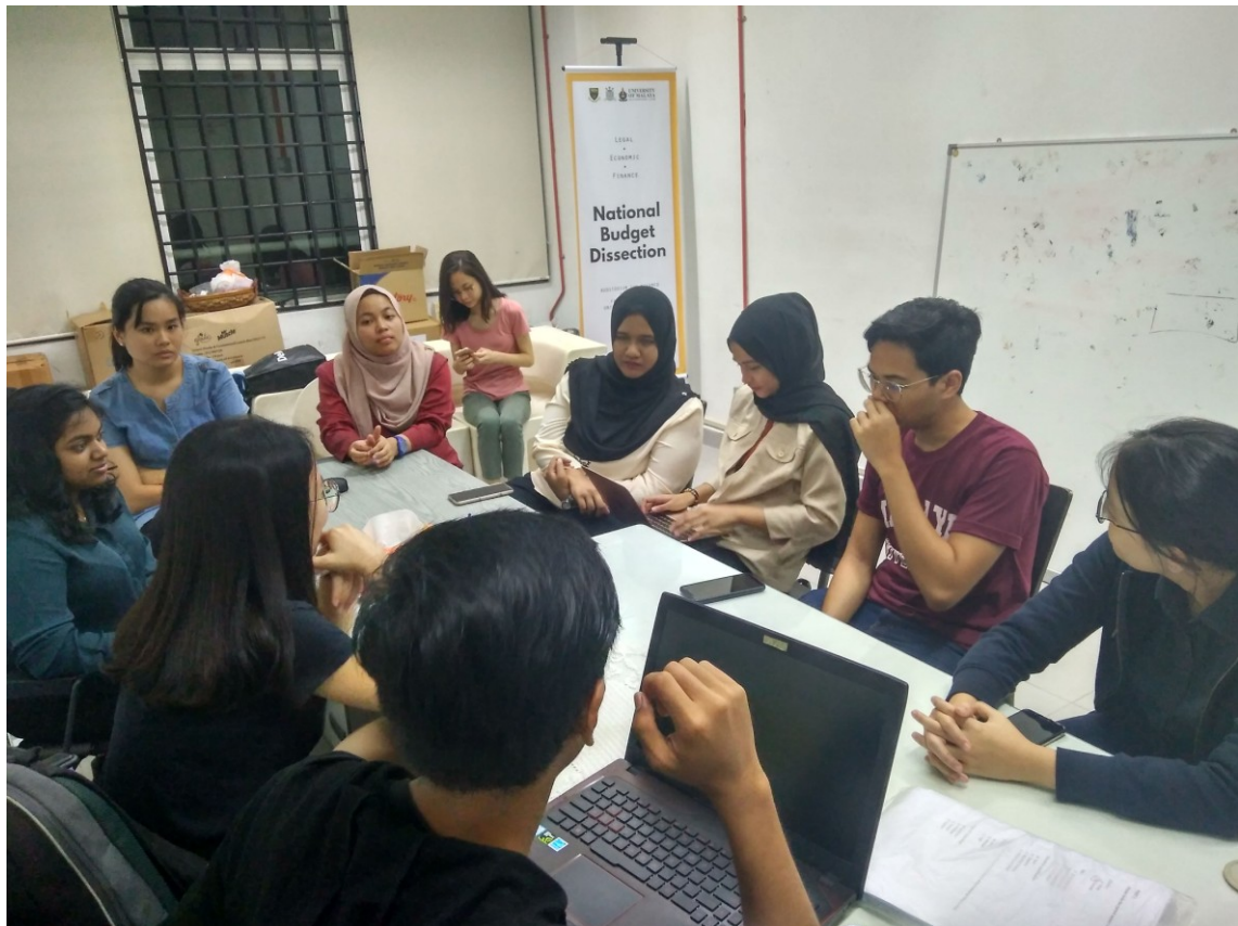
APPENDIX 1_XI: The PEKUMA Meeting