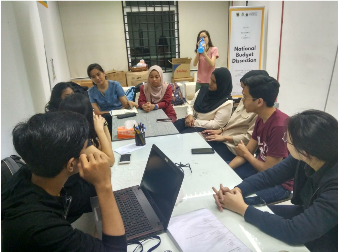
APPENDIX 1_IX: The PEKUMA Meeting