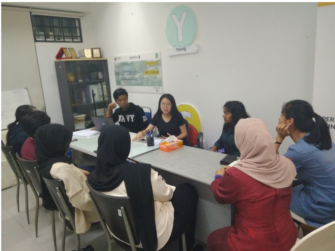
APPENDIX 1_IV: The PEKUMA Meeting